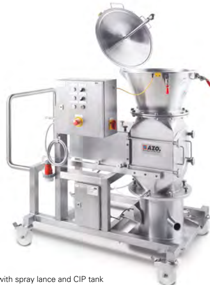
Lump breaker station with spray lance and CIP tank