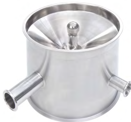
CIP tank for cleaning of the lump breaker station