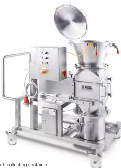
Lump breaker station with collecting container

replaced with a dummy cover. Cleaning is performed in several steps; the sequence can be determined by the customer.