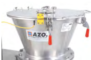
Cover of the inlet funnel with quick-release fasteners and safety switch